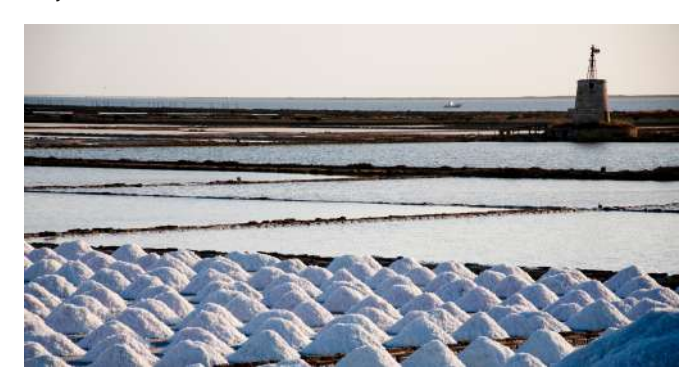
Day 4: La Martorana & Monreale guided tour

Dinner in external restaurant, transfer to the hotel and overnight stay.