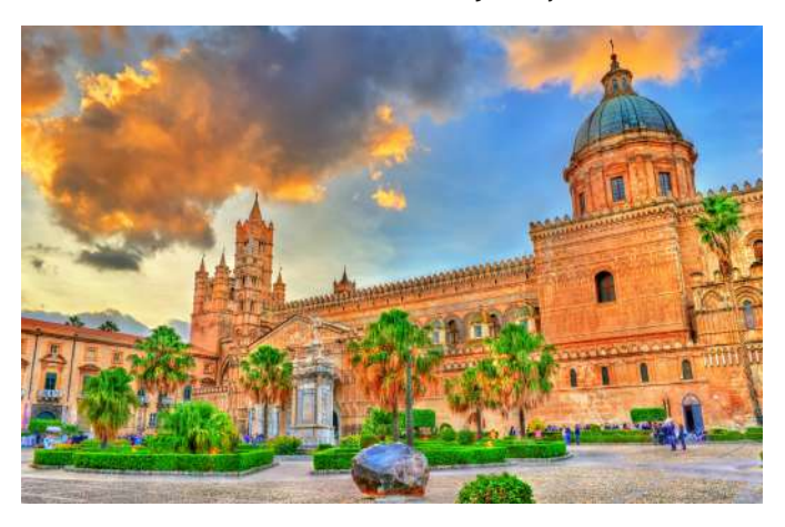
Day 2: Walking tour of Cefalù & Palermo

Arrival in Palermo, transfer to the hotel, accommodation and free time for lunch. Meeting with the guide and start of the walking tour of Palermo. We'll start from the Norman Palace, the Palatine Chapel, the churches of the historic center and the Regional Gallery of Sicily. Then, our guide will lead us to explore the interiors of the Teatro Massimo Vittorio Emanuele. We'll show us the stunning auditorium and the most interesting halls of the third largest opera house in Europe. Dinner in a typical restaurant, return to the hotel and overnight stay.